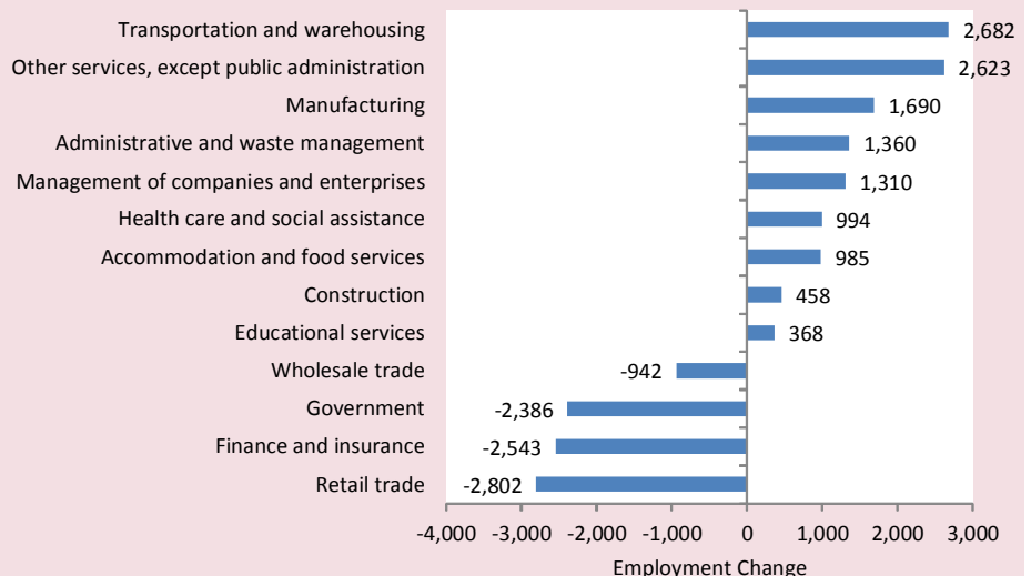
Chart 1: Industry Employment Change by Sector, 2017-18

Looking at the sectors with notable gains in 2018, several industries continued to improve from their 2017 levels. The