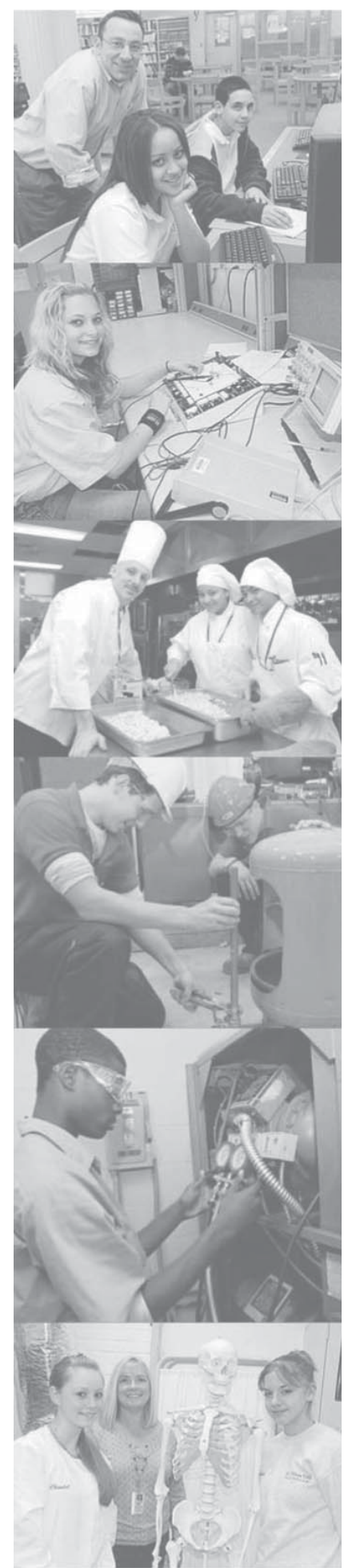
TABLE OF CONTENT$